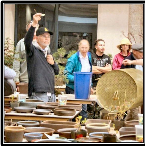
Daily Benefit Drawing & Live Auction

Fundraiser for THE GOLDEN STATE BONSAI FEDERATION COLLECTION AT THE HUNTINGTON February 24-25, 2018