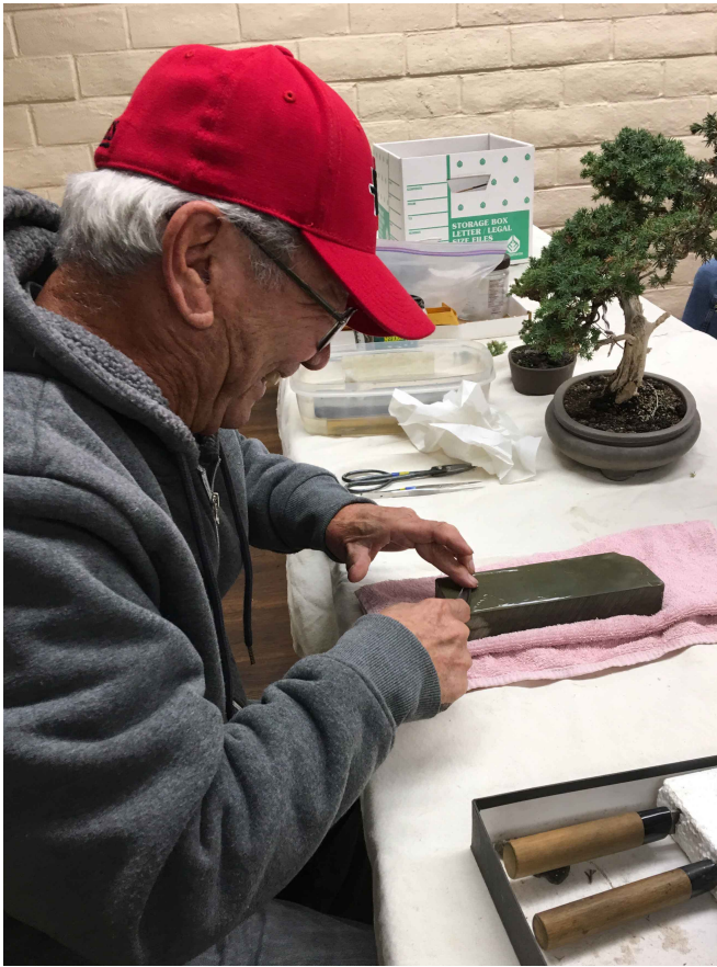
Expert Sharpening of Grafting Knife