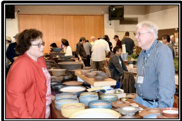
Select Vendors Selling Top-Quality Tools, Pots and Trees

GSBF Early Bird Passes For Bonsai Club Members 7:30am - 5:00pm General Public 10:00am - 5:00pm