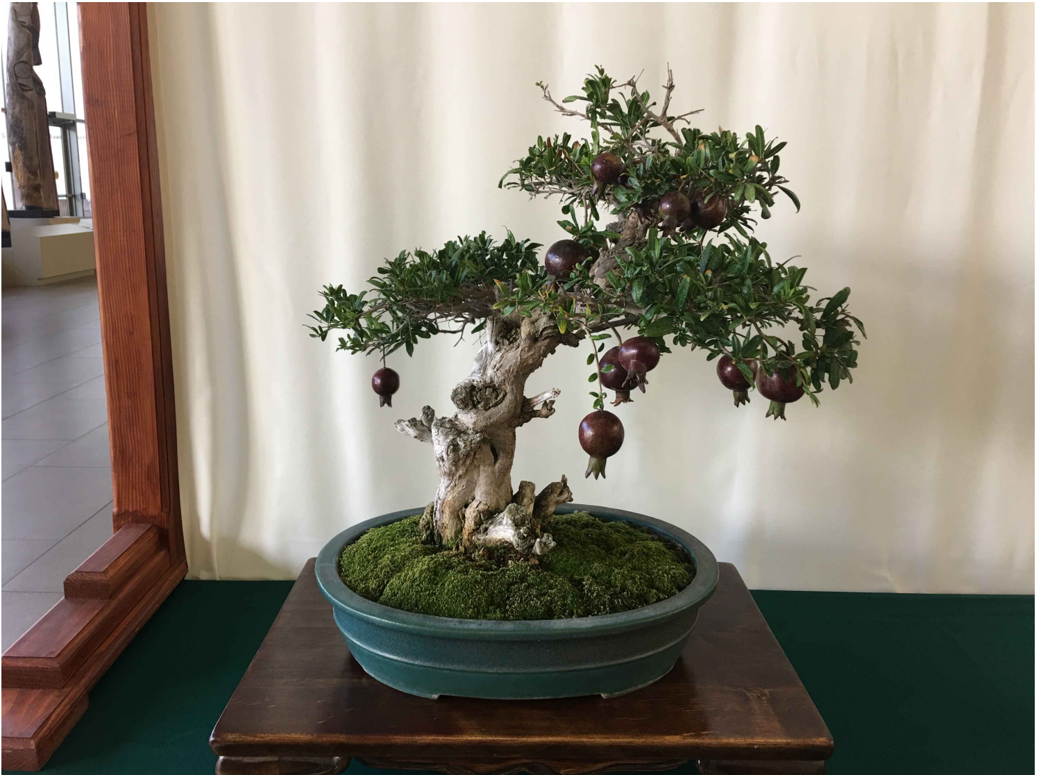
The undisputed sensation of the Bowers show, Tak Nakamura's black pomegranate.

The two landscapes created at the show will be part of the raffle at this meeting!