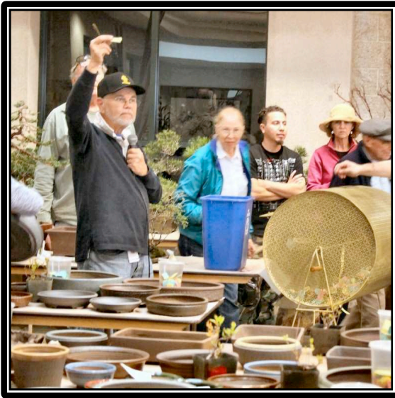
Daily Benefit Drawing & Live Auction

Fundraiser for THE GOLDEN STATE BONSAI FEDERATION COLLECTION AT THE HUNTINGTON February 23-24, 2019