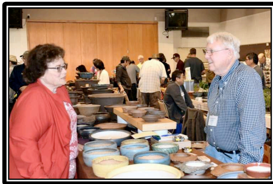
Select Vendors Selling Top-Quality Tools, Pots and Trees

GSBF Early Bird Passes For Bonsai Club Members